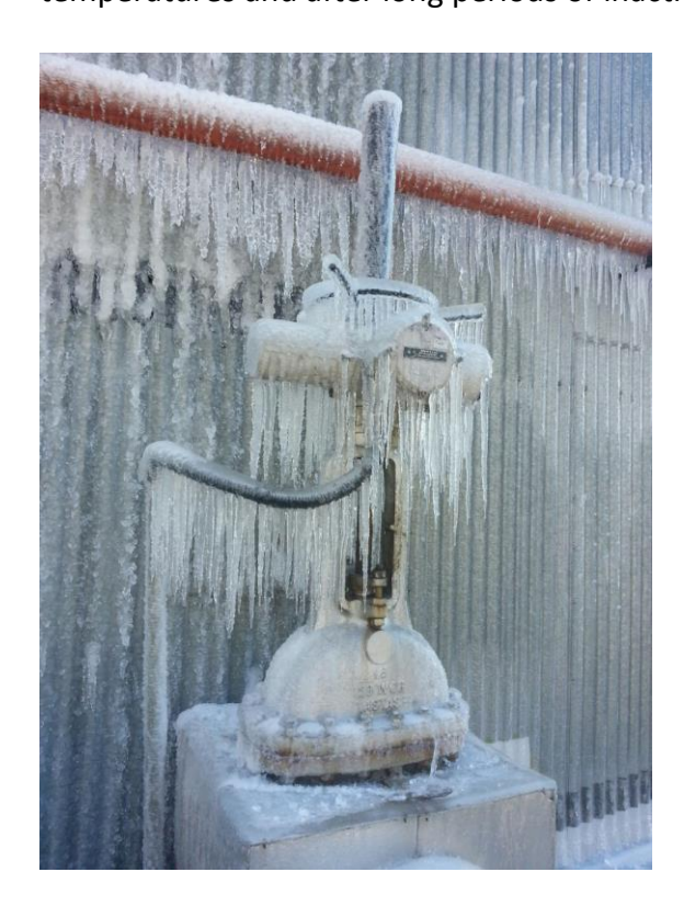
Fig 1 - Rotork IQ technology enables reliable operation without an internal heater at even the lowest temperatures.

The IQ3 actuator design enables it to operate reliably without an internal heater at even the lowest temperatures. The key to this proven benefit is the actuator's double-sealed enclosure, combined with 'non-intrusive' setting and commissioning. The separately sealed terminal compartment enables site wiring to be completed without exposing any internal parts to the ambient environment. Setting the switches and commissioning is performed with the 'nonintrusive' hand held setting tool without removing any covers. This means that the actuator is fully hermetically sealed from the time it leaves the factory and there is no opportunity for moisture to penetrate the enclosure in the field. Rigorous low temperature testing of the actuator's electronics and display window confirm that they operate reliably at very low temperatures and after long periods of inactivity.