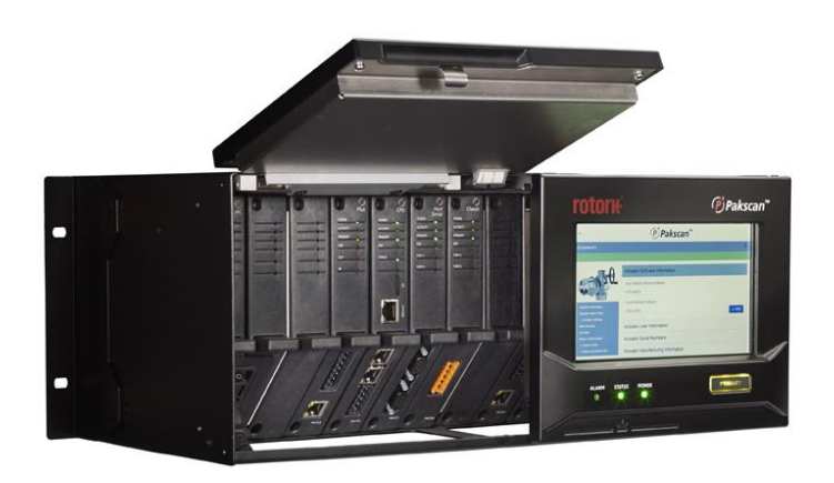
Fig 2 - Each Pakscan network, wired or wireless, is supervised by the Pakscan Master Station, which links the plant network with the control system. Pictured here, the latest Pakscan P4 Master Station has introduced an ultra-fast Plus network.

The expense inherent in traditional hardwiring, where more data demands more cables, is eliminated by the adoption of the digital control network. Reduced cabling complexity, reduced installation costs and the desire to obtain increased levels of information from the plant have all contributed to the development and adoption of the digital technology. Rotork has been a pioneer in this field and the Rotork Pakscan system, now in its fourth generation, is specifically designed for the valve actuation environment.