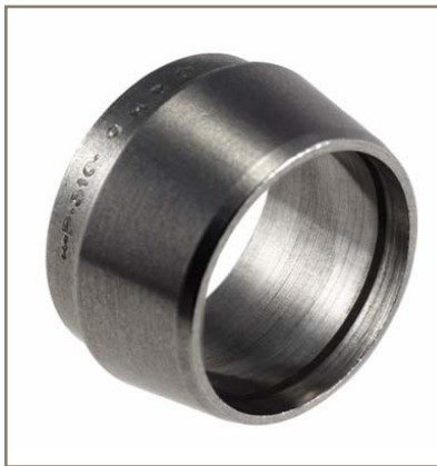
Fig 1. Parker CPI™ Single Ferrule

This article discusses the evolution of ferrule design and hardening technology, using the example of the Parker Hannifin CPI™ single ferrule compression fitting (Fig 1), but the basic principles also apply to two ferrule compression fittings, such as Parker Hannifin's A-LOK®, as well as the high pressure design.