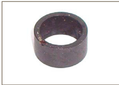
As-machined + Carbonitrided Test Piece