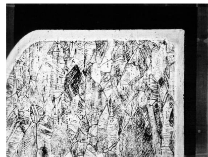
Fig 4. Micrograph of the front edge of a Suparcased™ ferrule. 10 percent oxalic acid electoretch.

In order to demonstrate the improvement in corrosion resistance of the Parker Suparcase™ ferrule hardening process, tubular test pieces were machined