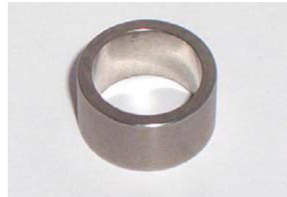
As-machined + Supercase™ Test Piece