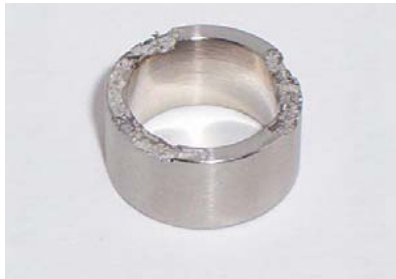
As-machined Test Piece