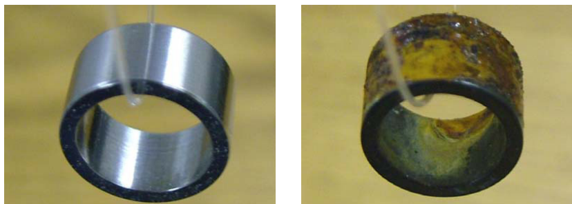
As-machined + Supercase™ Test Piece