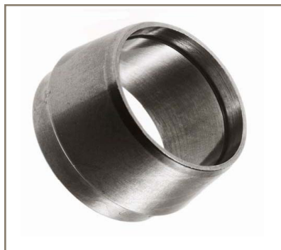
Figure 6. ASTM B 117 Salt Fog test results on a Parker CPI™ Supercase™ ferrule.

related alloys to pitting and crevice corrosion when exposed to oxidizing chloride environments. The results predict performance in certain real environments, such as natural seawater at ambient temperature and strongly oxidizing low pH chloride environments. The test results are shown in Table 1.