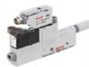
Air Preparation Unit