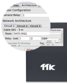
Easy setup of relays for each cable