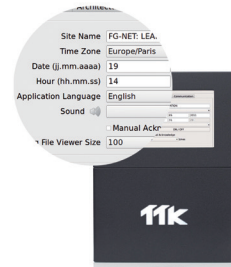
User-friendly interface of configuration