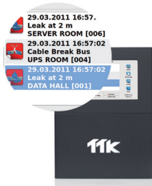
Simultaneous alarms displayed on one screen